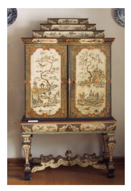
A cabinet with "Chinese" scenes, Saxony (?), 1739

The late 17th century marks the beginning of the "vogue for the Orient," which reached Poland via England, France, and Germany and which involved the vogue for Chinese culture. This process could be described as the Orientalization of the Polish Orient. In contrast to the direct reception of the Islamic Orient, which was accepted, familiarized, and, as it were, naturally assimilated into Polish culture,6 the "vogue for the Orient" (India, China, and Japan) was a mediated import. We might refer here to Edward W. Said's concept of Orientalism. In this context Orientalization, which includes a "vogue for China," would mean a specific perception and representation of Far Eastern countries by the