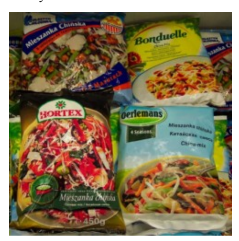
"Chinese" mixed vegetables produced in Poland

In 18th-century Polish literature China was represented as an idyllic and fantastic land of rich cities, beautiful gardens, wise and just monarchs, and well-educated mandarins who could teach us wisdom and tolerance, gentleness, modesty, and virtue, the love of knowledge and respect for the elders. This idealized image of China was contrasted with the backward Poland, which should follow China's example in the organization of the state and the virtues of its inhabitants. In 1765 the journal Monitor featured a series of fictional accounts of the Chinese sage Yunip's travels in Poland, which included his advice on what Poland should be like. Ignacy Krasicki, an outstanding Polish author, used Chinese protagonists as vehicles of moral lessons in his "Oriental Fables." Oriental stylization in literature served to express authors' views on current political