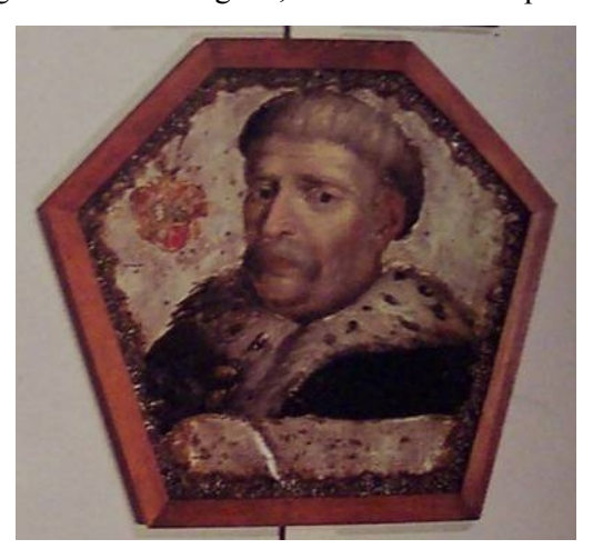
Coffin portrait of Polish noblemen (17th - 18th c.)

ulation and an invented genealogy, gave rise to a specific culture, way of living, and ideology that prevailed in Poland in the 16th and 17th centuries. Called Sarmatianism after the name of that ancient tribe, this culture became a lasting foundation of Polish national identity. During that period Polish culture absorbed many elements of the culture of the Islamic East: Turkish, Tartar, and Persian influence on Polish culture could be compared to Moorish influence on Spanish