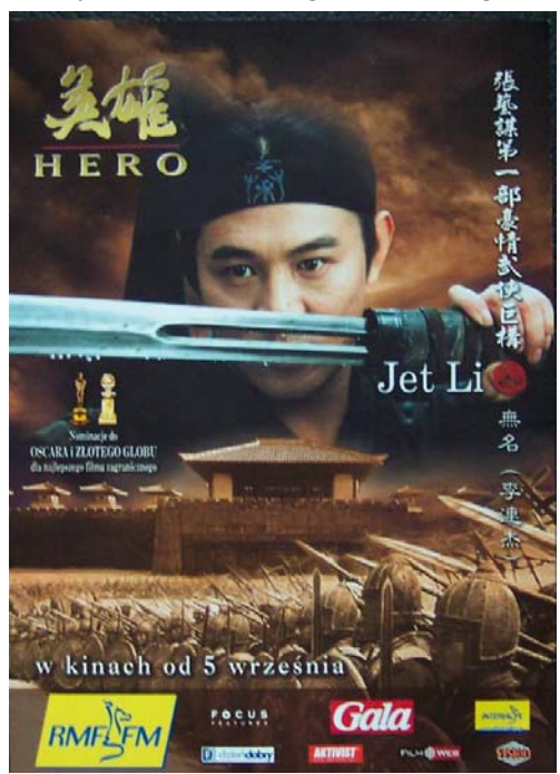
Polish poster for the movie "Hero".

like Chinese antiques facilitates concentration during work; laquerware red creates a warming and energizing effect; Chinese lanterns give a soft, diffused light; and prints modeled on Chinese characters emphasize the Oriental style. We are also recommended to decorate the interior with rhythmically arranged pottery. The whole should have an aura of peace and harmony, which will be conducive to attaining inner peace. Also helpful will be wallpaper with prints showing life in the Chinese countryside, which along with a stylized metal bird cage suggests the fairylike atmosphere of imperial China. Despite the passage of time the image of China as manifested in contemporary Polish chinoiserie is not much different from that of the 18th century. It is still the fairylike, exotic China inhabited by slim people in long robes and pointed hats; a country whose land-scape is strewn with pagodas and gardens, where farmers cultivate rice and lead an idyllic life of fishing and drinking tea.