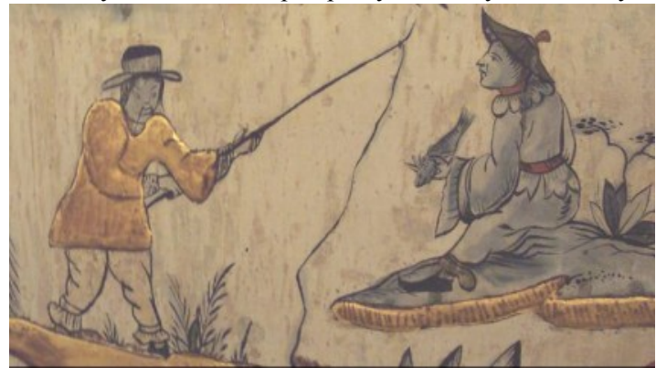
Chinese cabinet, fragment

was reflected in Western European art of the late 17th and 18th centuries, and then also in Polish art, as chinoiseries. The latter demonstrate that Polish interest in China was a superficial fascina-