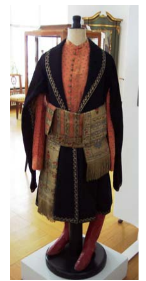
A Polish costume (zupan) from 17th c. (Museum of Applied Art, Poznan)

From the late 15th to the late 17th centuries Poland had direct connections with Middle Eastern countries, which involved some degree of openness to the cultural influence of the Orient. Those connections resulted from four factors: firstly, the Jagiellonian monarchy shared the border with the Ottoman Empire (until the battle of