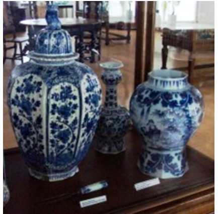
Vases with Chinese motifs (Delft, The Netherlands, early 18th c.)

particularly of weapons. The Baroque passion for exoticism brought to the royal court, and soon afterwards to magnates' and noblemen's houses, original objects from China (including those obtained as Turkish booty after the Succor of Vienna) and their imitations. Apart from chinoiserie in ornaments, clothing, or porcelain the presence of China in Poland involved the use of Chinese medicinal herbs, which were also utilized as spices (ginger, cinnamon, cloves). Tea, or "herba thea," was also introduced at that time. Origi-